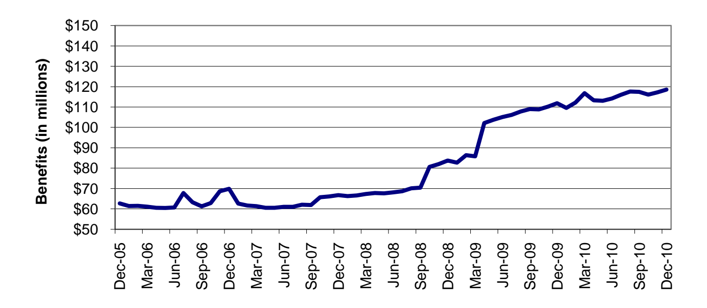
Figure 7 Food Stamp Benefits 60-Month Trend through December 2010

DSS MONTHLY MANAGEMENT REPORT / PAGE 152