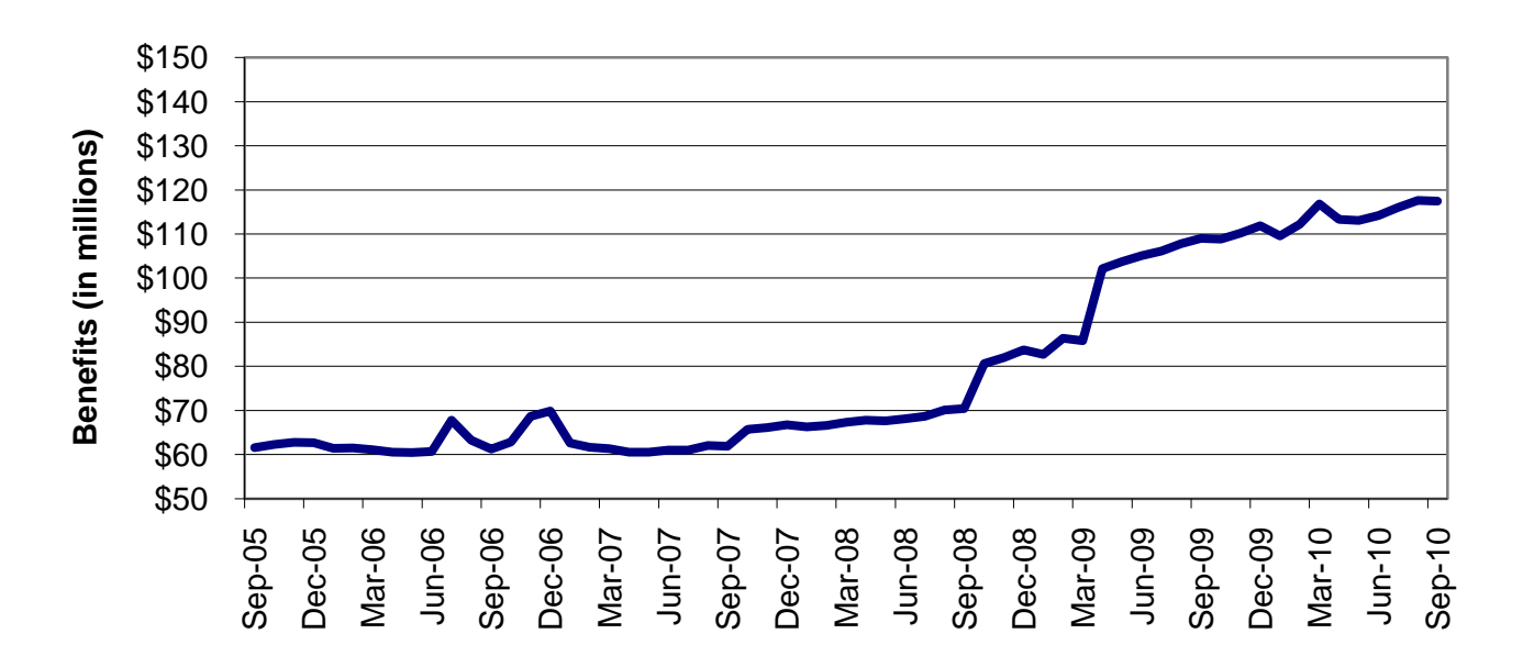
Figure 7 Food Stamp Benefits 60-Month Trend through September 2010

DSS MONTHLY MANAGEMENT REPORT / PAGE 152