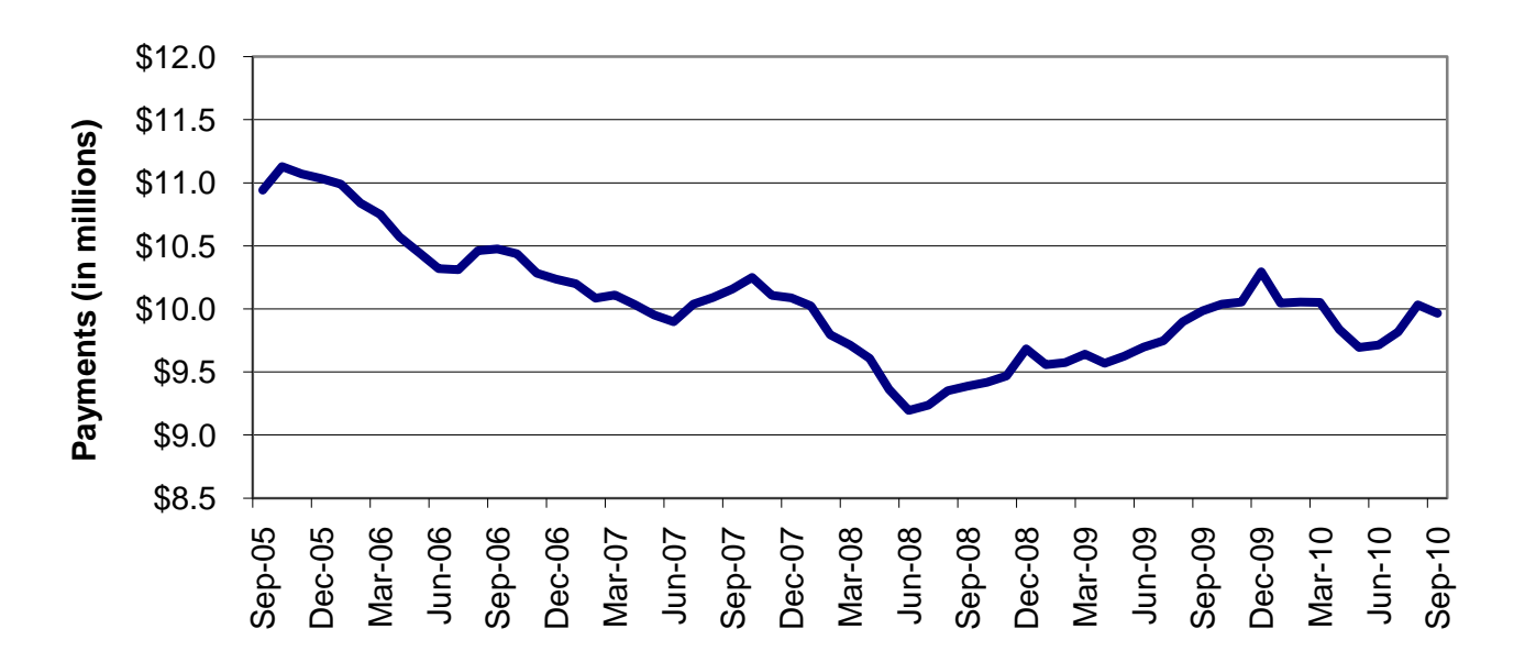
Figure 3 Temporary Assistance Payments 60-Month Trend through September 2010