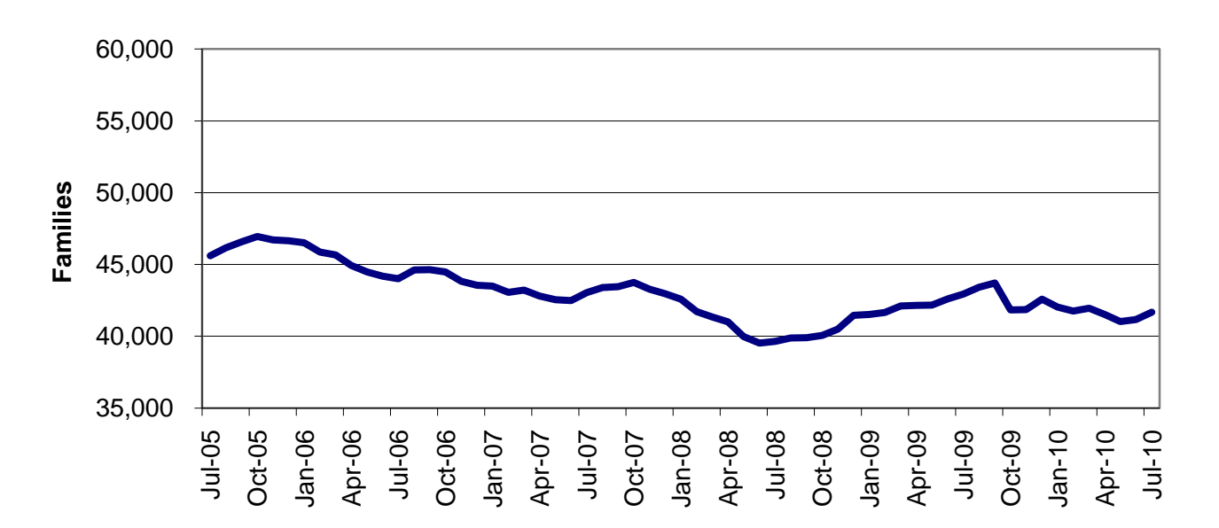
Figure 3 Temporary Assistance Payments 60-Month Trend through July 2010