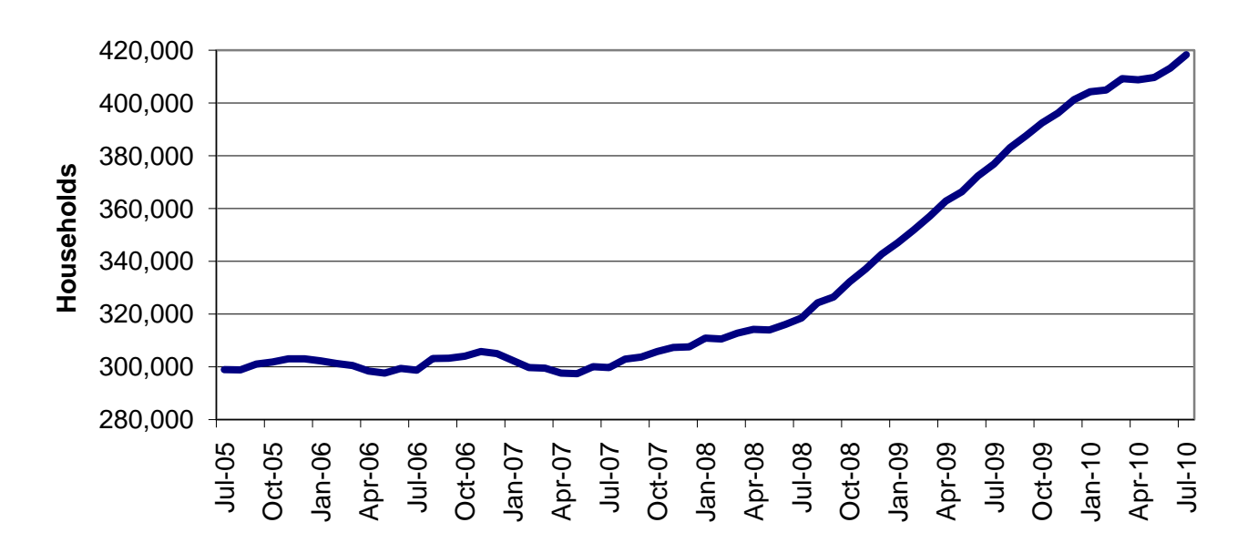
Figure 7 Food Stamp Benefits 60-Month Trend through July 2010