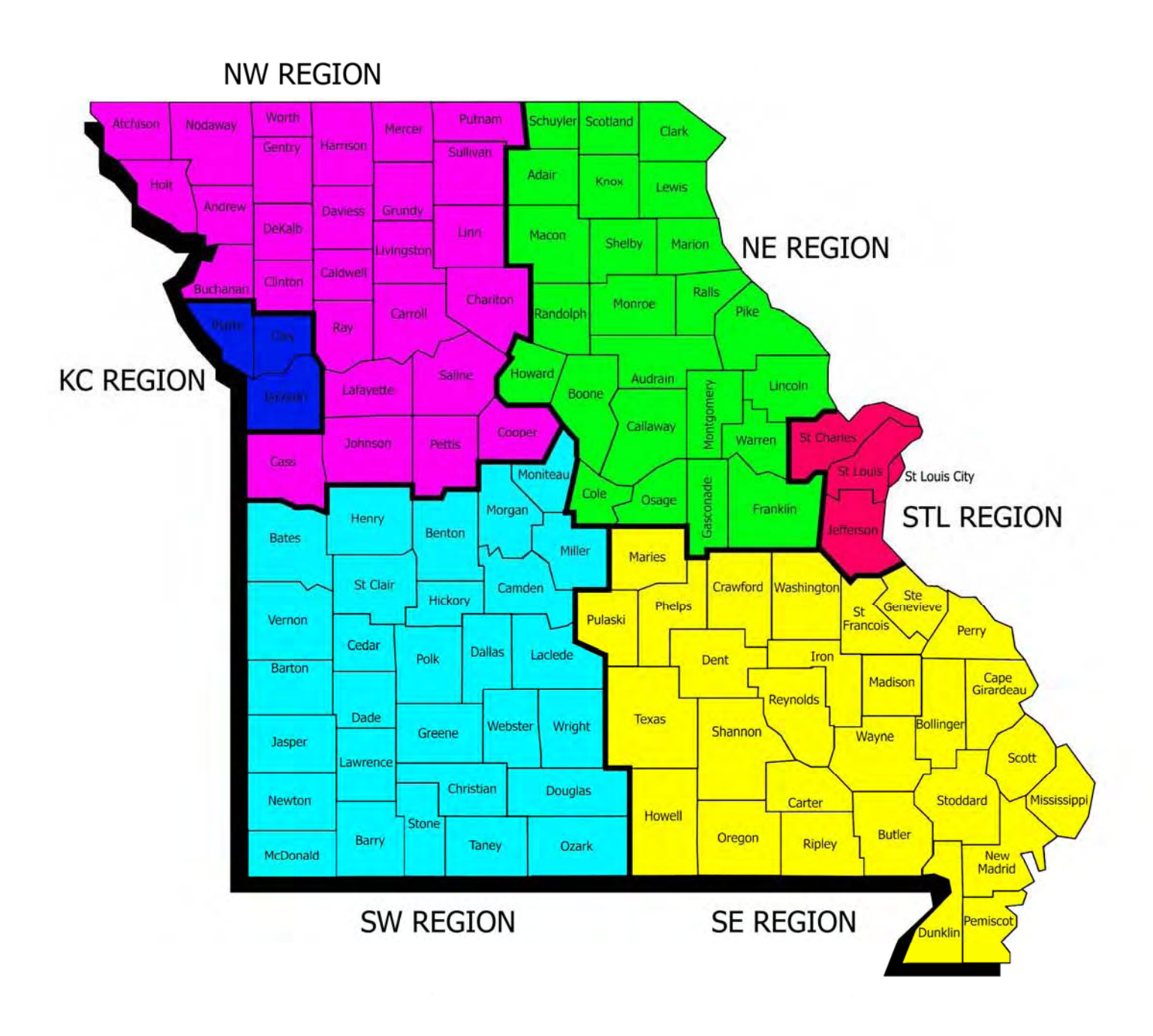
Figure 1 Department of Social Services Regions