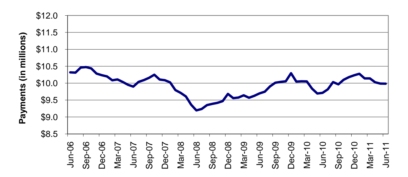
Figure 3 Temporary Assistance Payments 60-Month Trend through June 2011