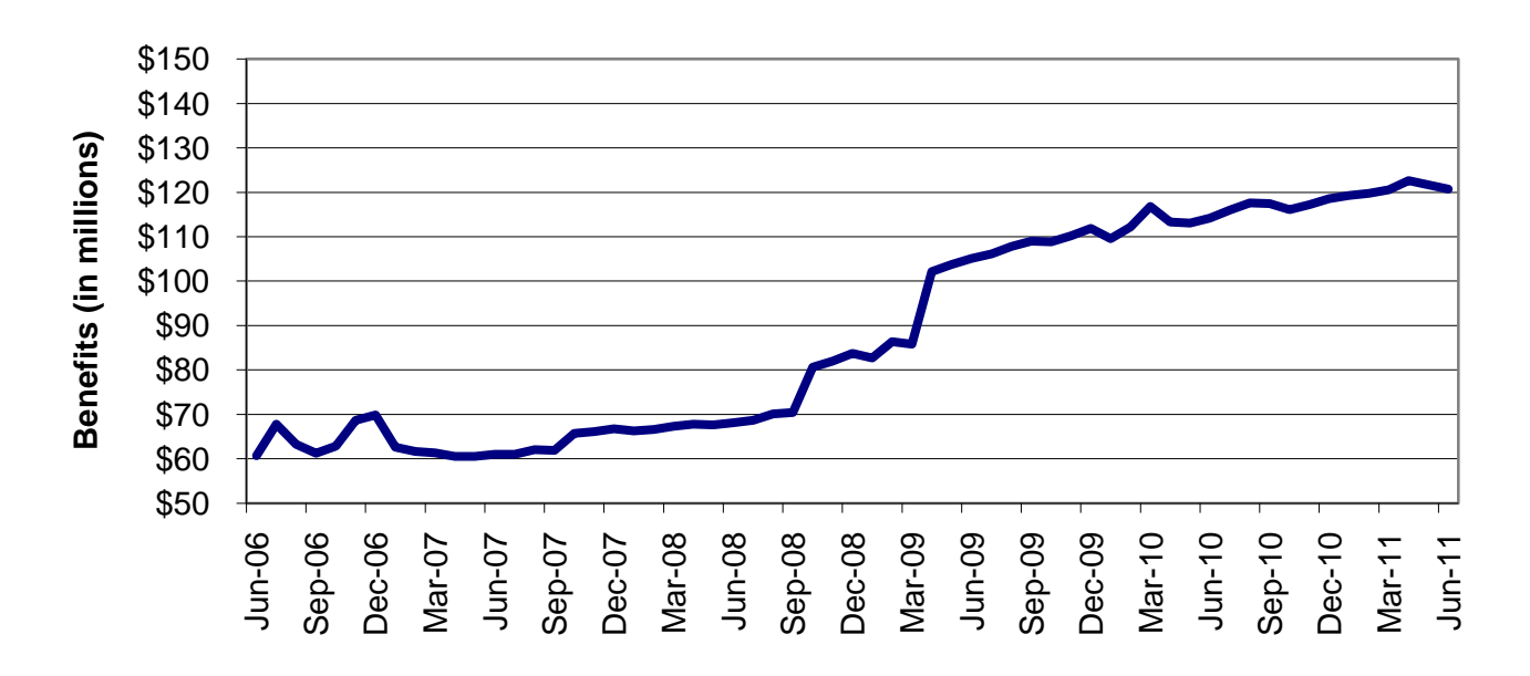
Figure 7 Food Stamp Benefits 60-Month Trend through June 2011