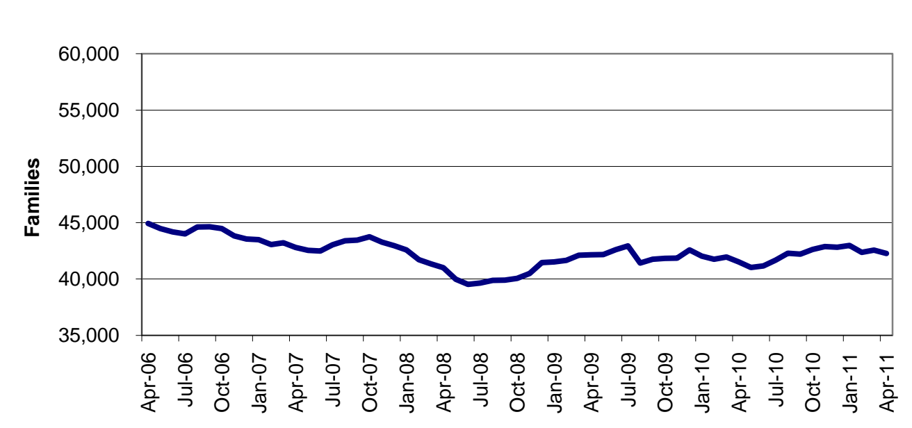
Figure 2 Temporary Assistance Families 60-Month Trend through April 2011