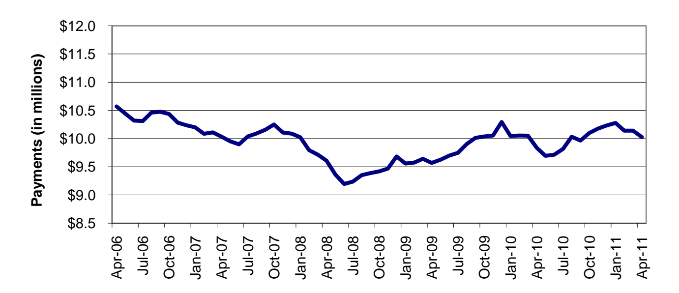
Figure 3 Temporary Assistance Payments 60-Month Trend through April 2011