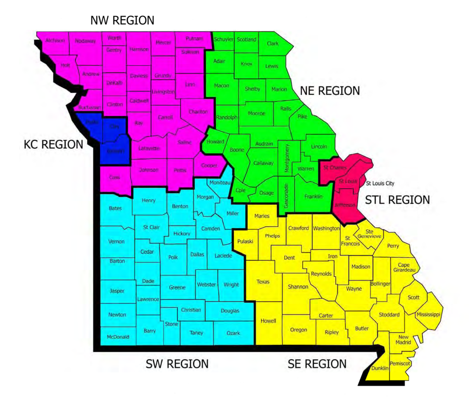
Figure 1 Department of Social Services Regions