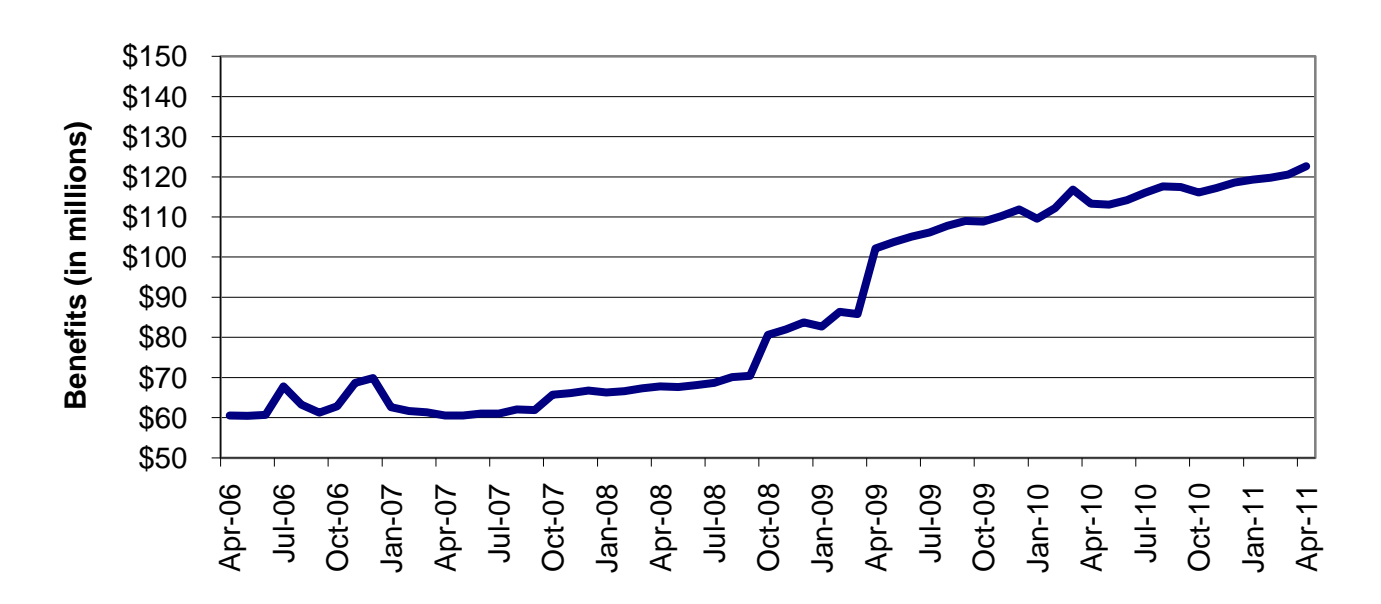
Figure 7 Food Stamp Benefits 60-Month Trend through April 2011

DSS MONTHLY MANAGEMENT REPORT / PAGE 152