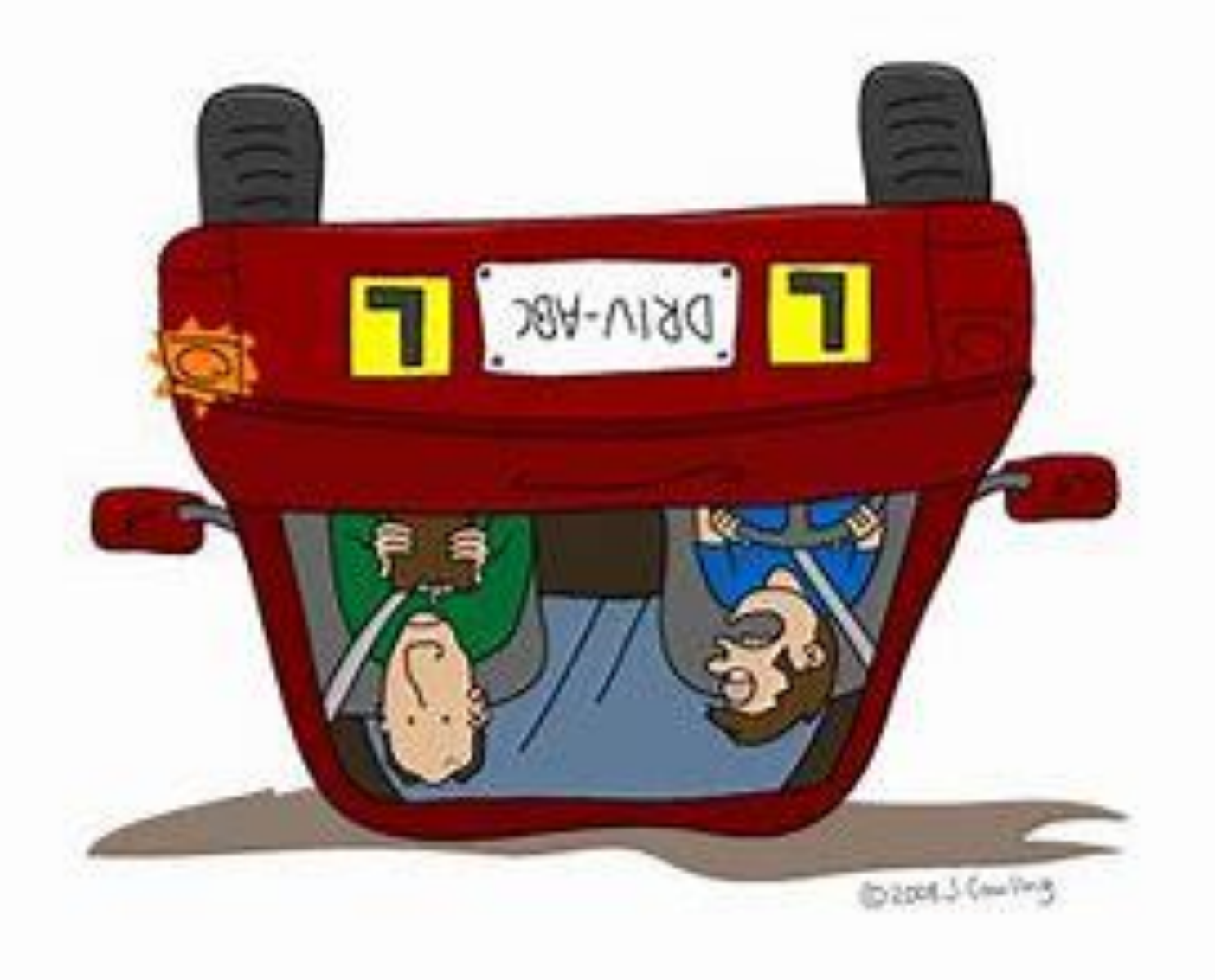
That's a fail, huh?